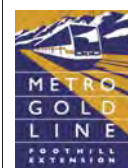
Foothill Extension Bus Interface Plan